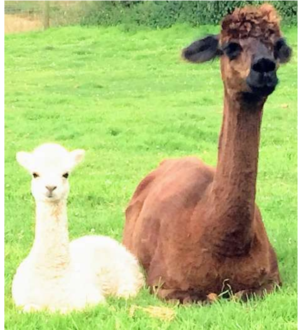
A grown-up Daniella with her cria