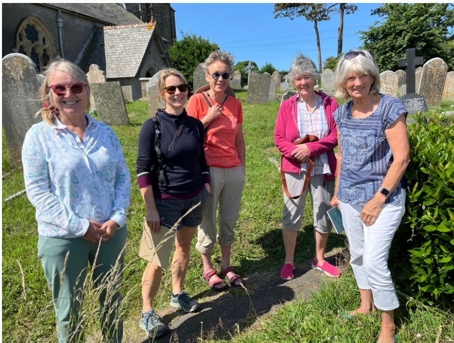
The Living Churchyard team on the wildflower meadow survey with BeWild